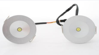
EPACK/LED2 HEAD (CHROME) & EPACK/LED3 HEAD (WHITE)