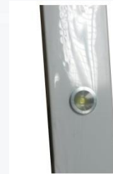
EPACK/LED INSTALLED INTO BATTEN