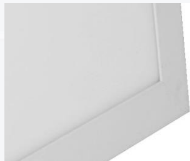
Standard LED panel (above) vs Anti-Glare LED panel (below)